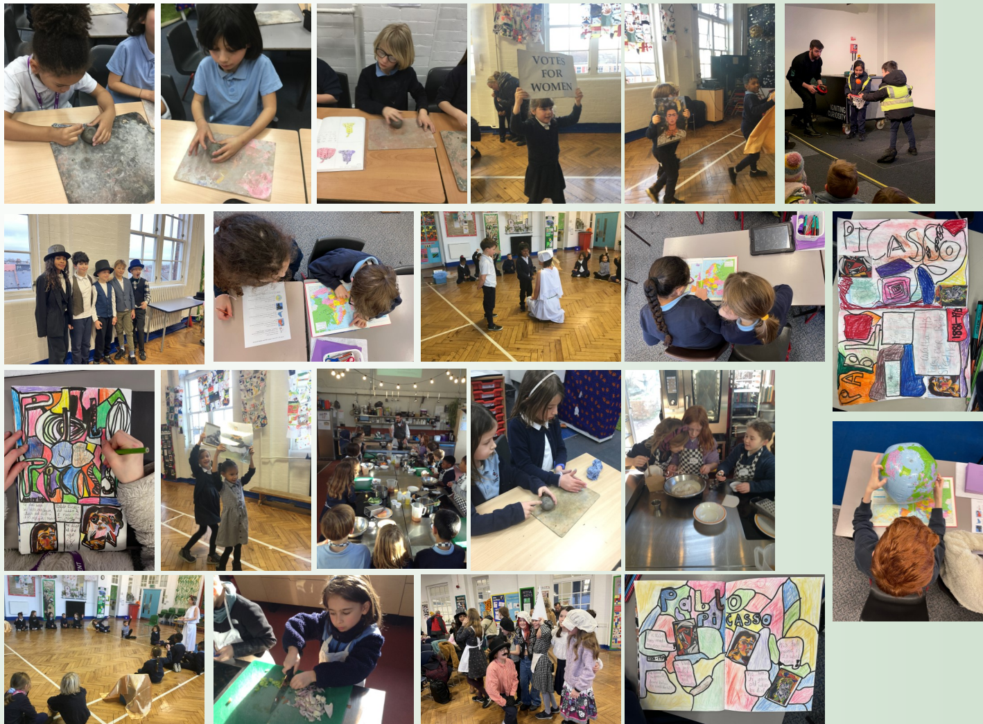
Millfields Community School Term Dates 2024-25